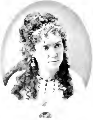
VINNIE REAM HOXIE.